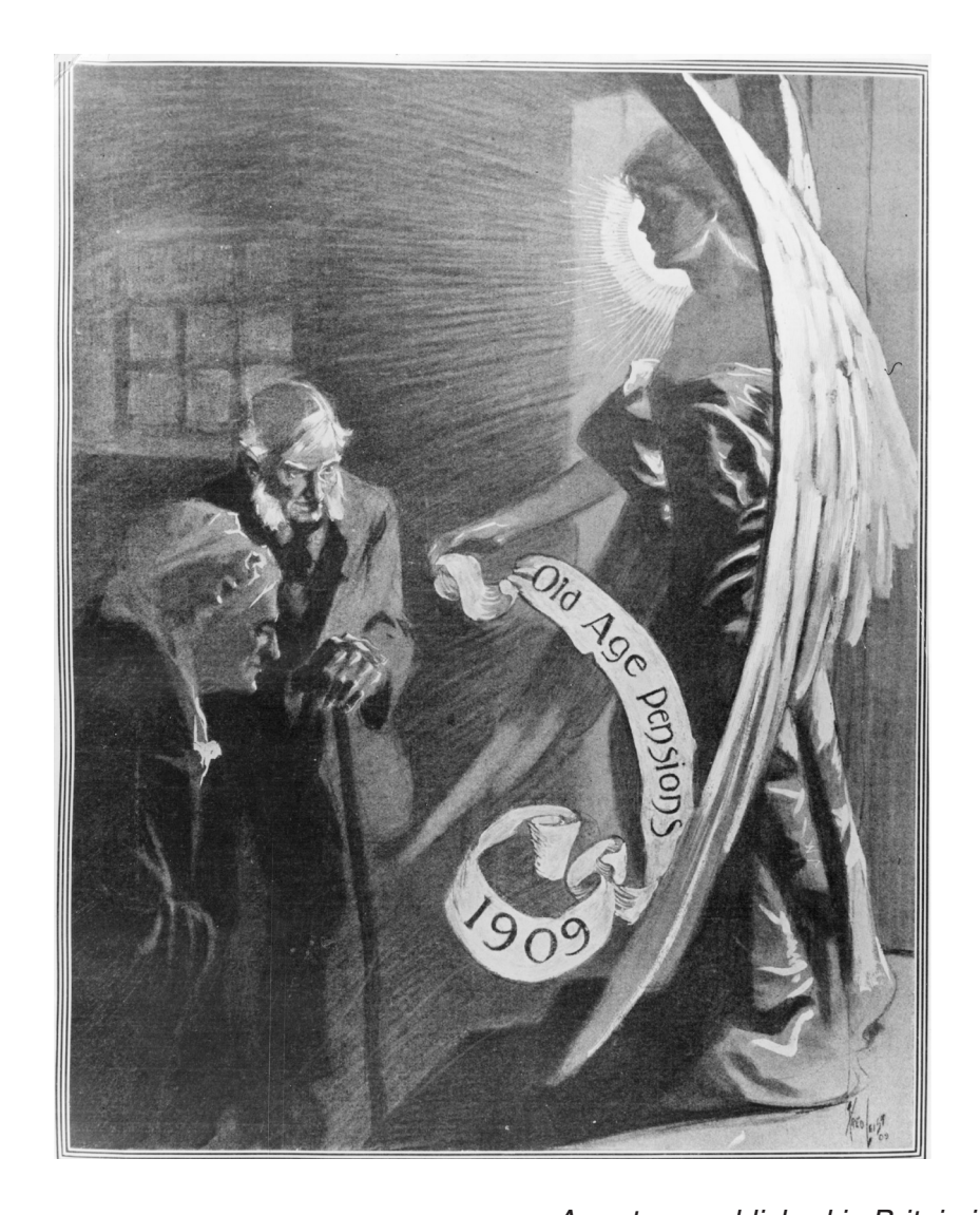
A cartoon published in Britain in January 1909.