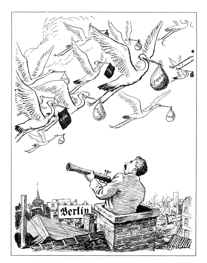
THE BIRD WATCHER

A British cartoon, published in July 1948, commenting on the Berlin Blockade. Stalin is shown holding a gun.