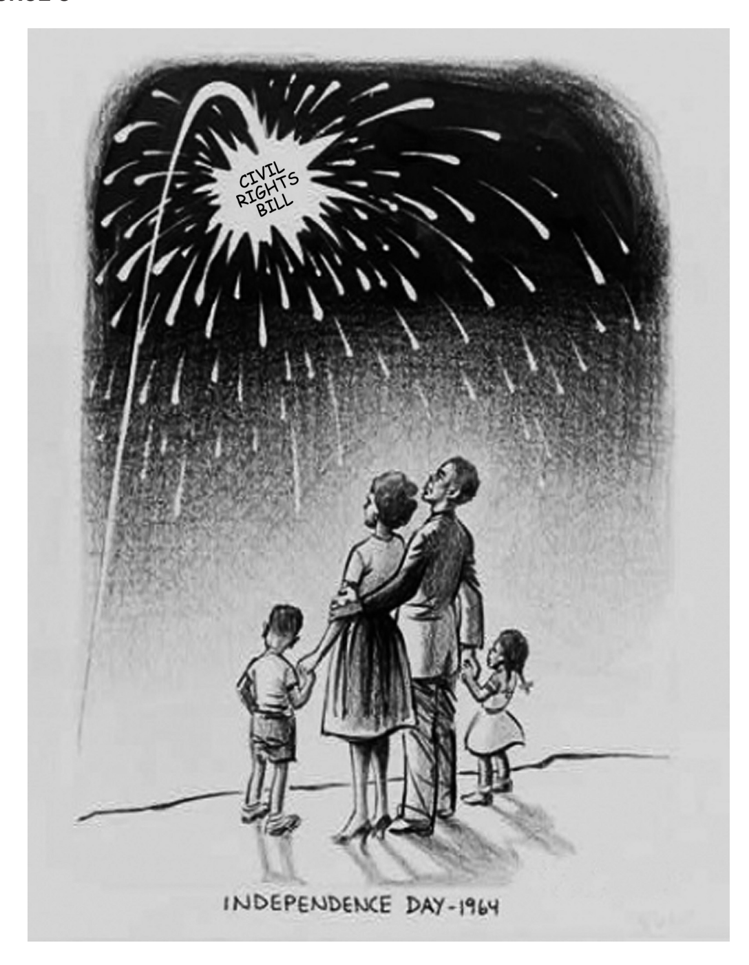
An American cartoon published in 1964.