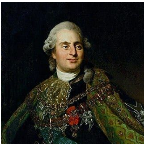
King Louis XVI

France also supplied financial aid during the American Revolution and now was in an economic crisis due to all these factors.