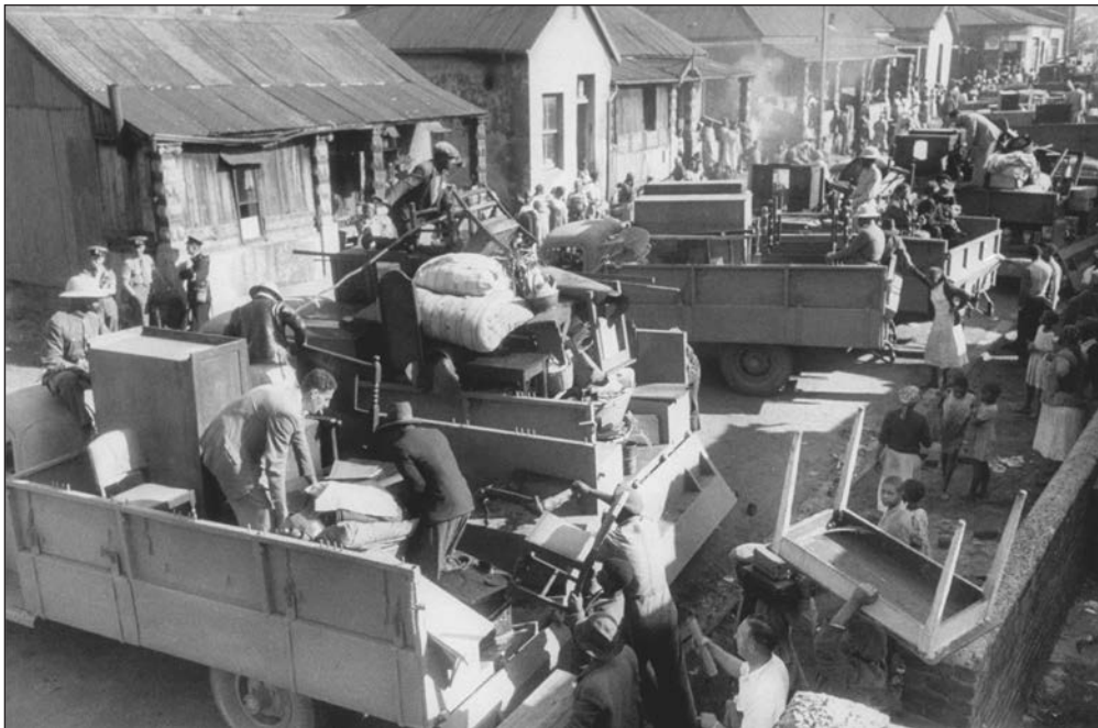
[A picture showing black South Africans leaving Sophiatown in 1955]

Use Source A and your own knowledge to describe the forced movement of black South Africans to the townships. [6]