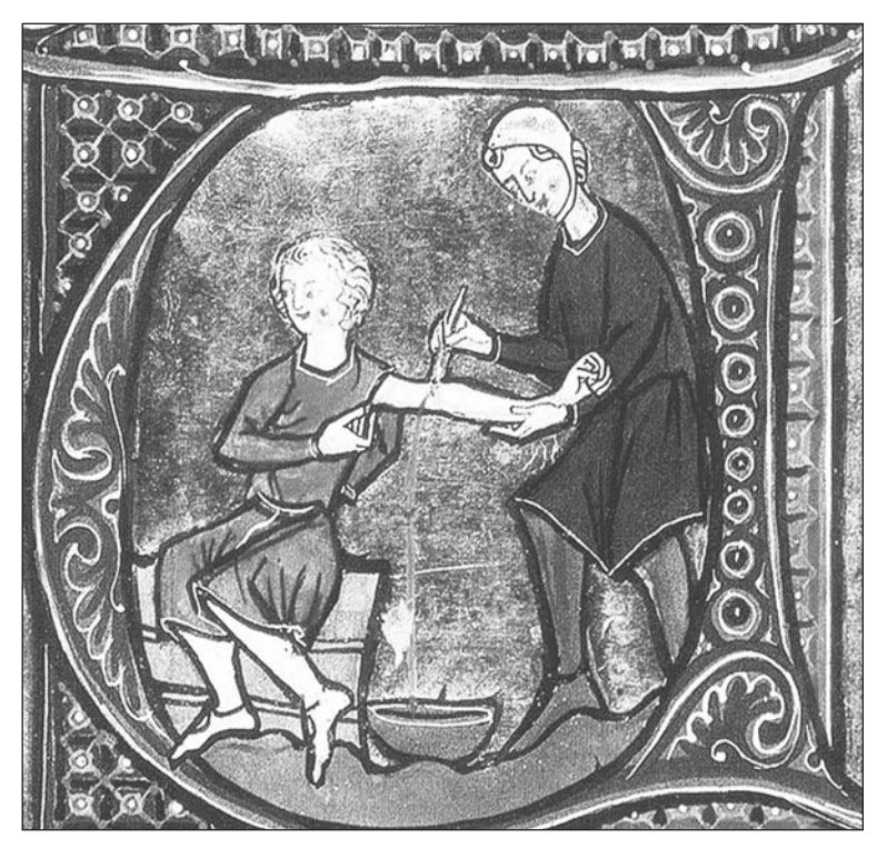
[A medieval doctor bleeding a patient]