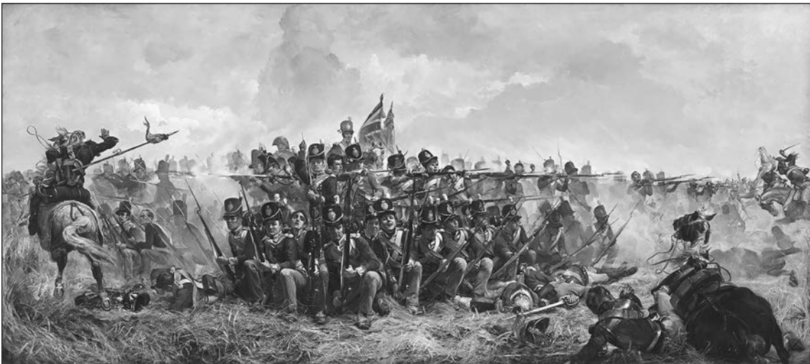
[British soldiers in the Napoleonic War]