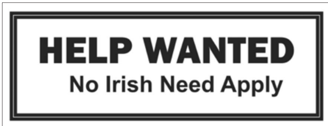
[A job advertisement seen in many American cities in the late 19 th century]