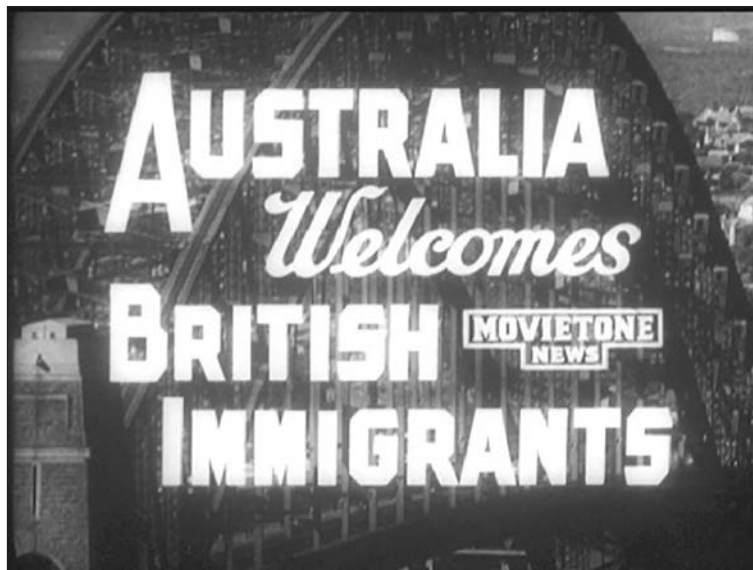
[A British cinema newsreel from the 1950s]

Use Sources A, B and C to identify one similarity and one difference in the experiences of emigrants over time. [4]