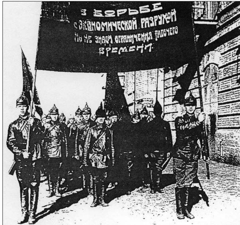
[A photograph showing members of the Cheka marching in a Communist rally in 1921. The banner reads "To avoid economic ruin everyone must work longer hours"]

Use Source A and your own knowledge to describe the role of the Cheka in the early years of Communist Russia. [6]