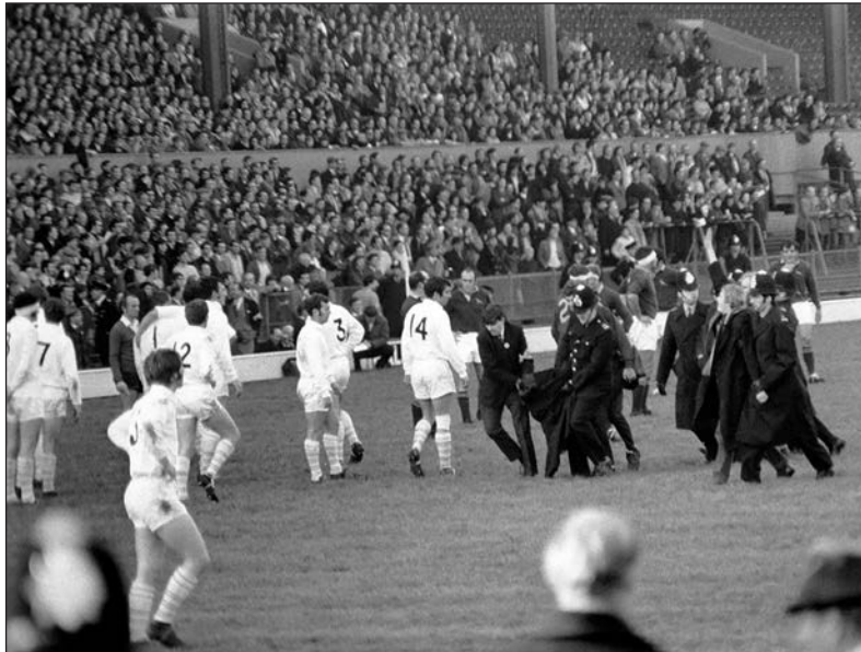
[A photograph showing demonstrators at a rugby match against the South African rugby team during their UK tour in 1969]

Use Source A and your own knowledge to describe the activities of the Anti-Apartheid Movement. [6]